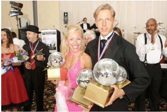
“Dancing Stars” Winners